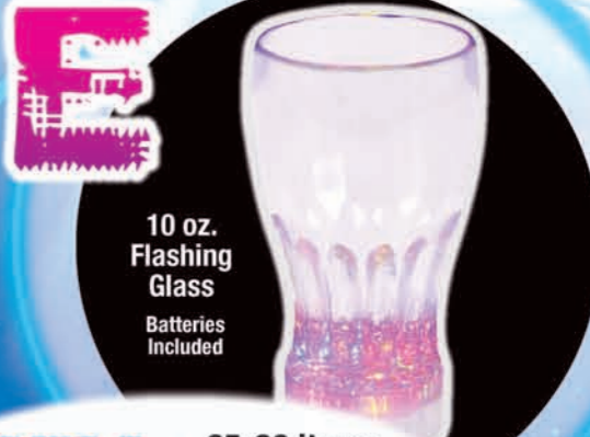
10 oz. Flashing Glass Batteries Included