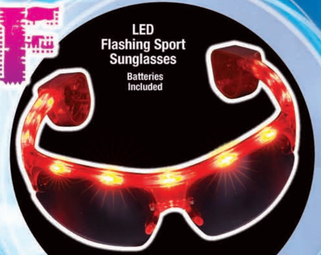
LED Flashing Sport Sunglasses Batteries Included