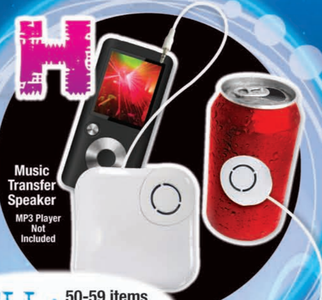
Music Transfer Speaker MP3 Player Not Included