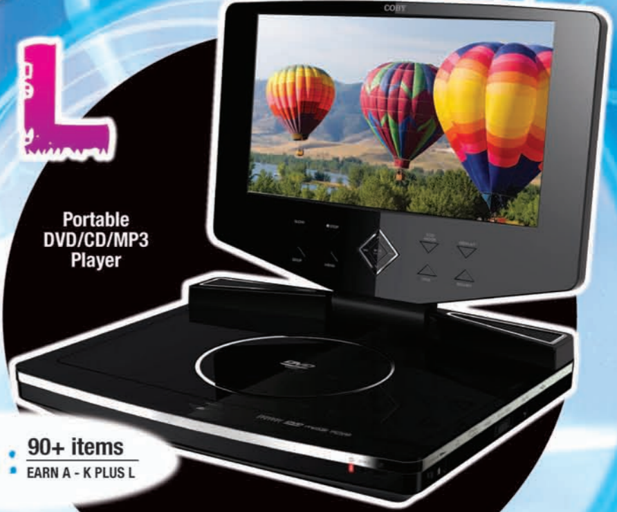
Portable DVD/CD/MP3 Player