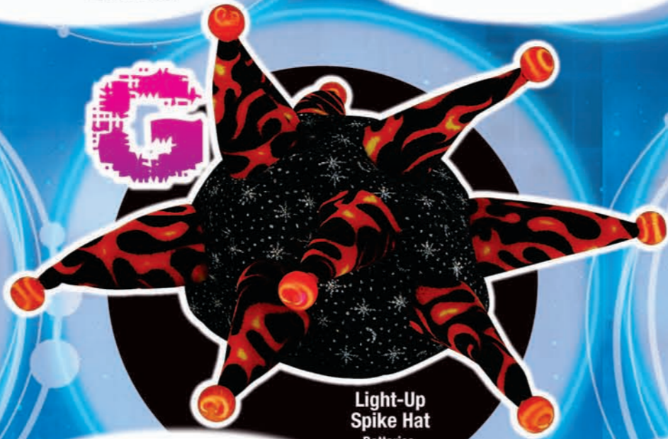
Light-Up Spike Hat Batteries Included