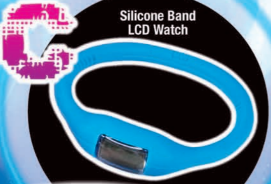
Silicone Band LCD Watch