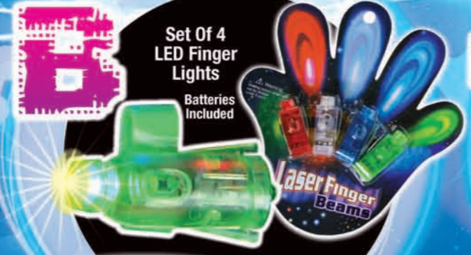
Set Of 4 LED Finger Lights Batteries Included