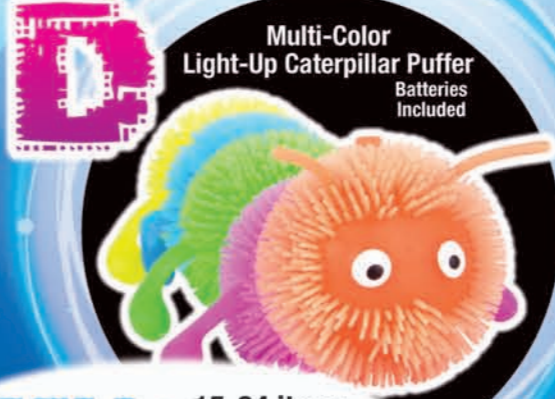
Multi-Color Light-Up Caterpillar Puffer Batteries Included