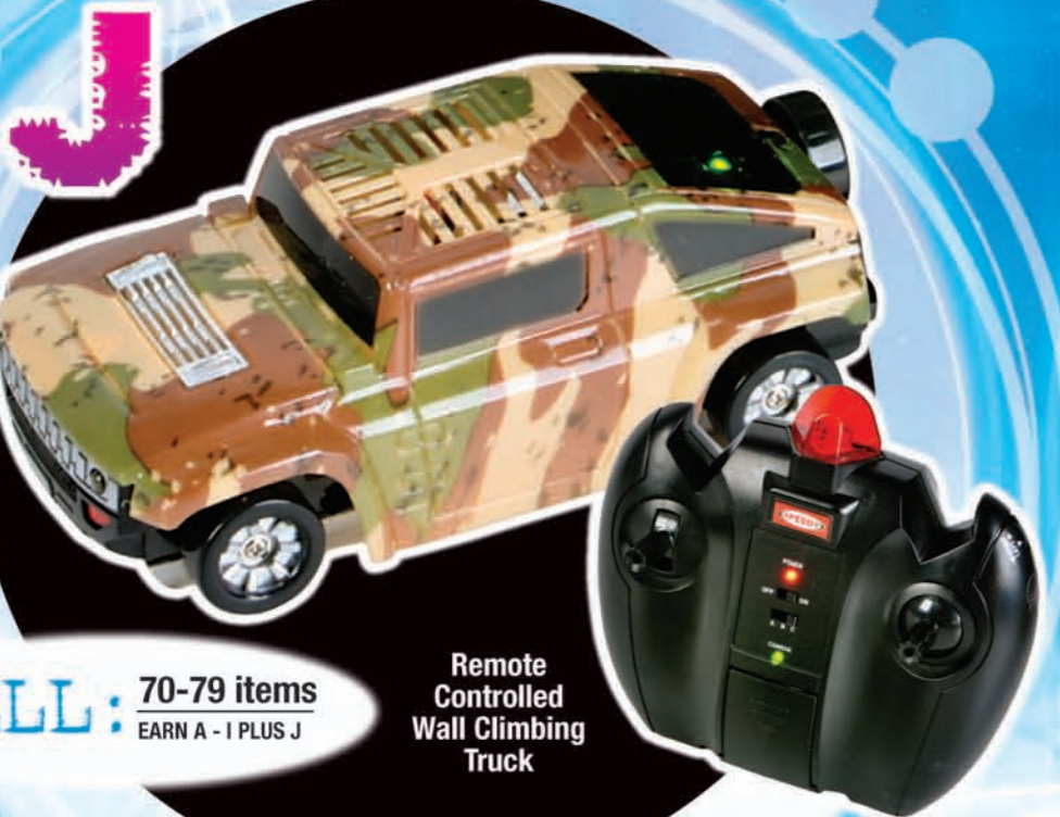
Remote Controlled Wall Climbing Truck